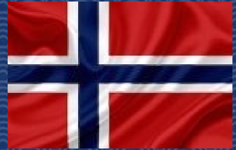
Flag of Norway