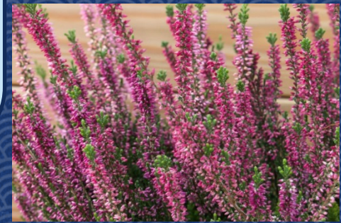
National flower: Heather 帚石楠