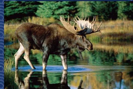
National animal: Moose (駝鹿)