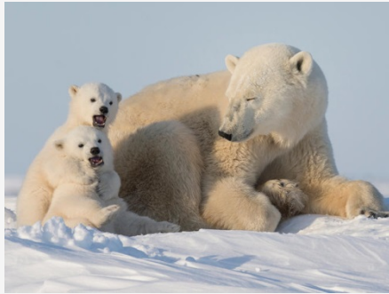
Polar bears (北極熊)