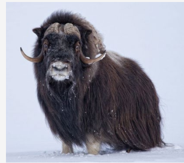
Musk oxen (麝牛)

Denmark is centrally located in (位於) the Arctic(北極), so we can see the above animals.